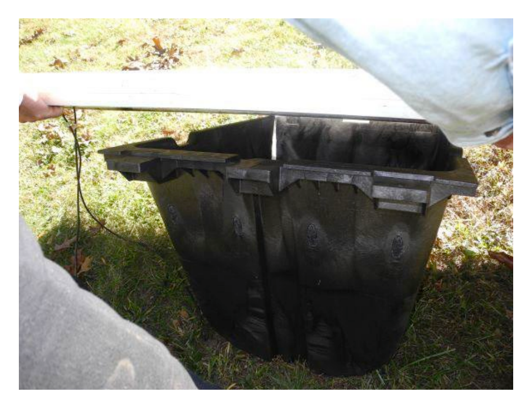
Figure 13. Worker lowering the panel onto the high side tabs