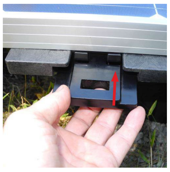
Step 3: Push clip upward into panel.

Step 2: Slide clip into slot under frame.