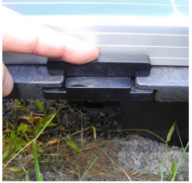
Figure 22. Security key fully seated.