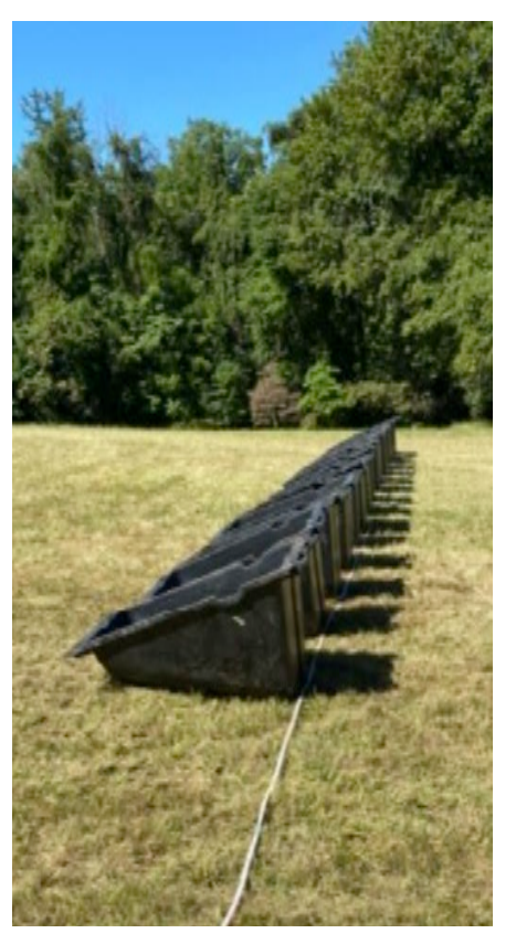
Figure 6. Properly aligned row of PowerRacks

TIP: Partially ballasting each rack at this stage helps to stabilize and prevent the rack from shifting after alignment.