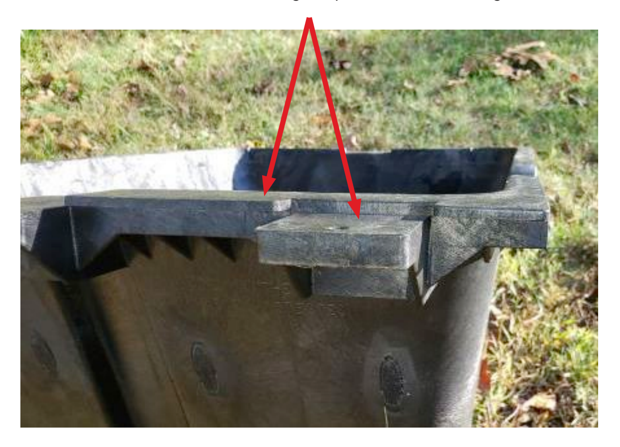
Figure 9. The tabs and flanges forming slot on the high side of the PowerRack

Close-up of upper flanges and support tabs which together form the slot for receiving the panel frame rail flange.