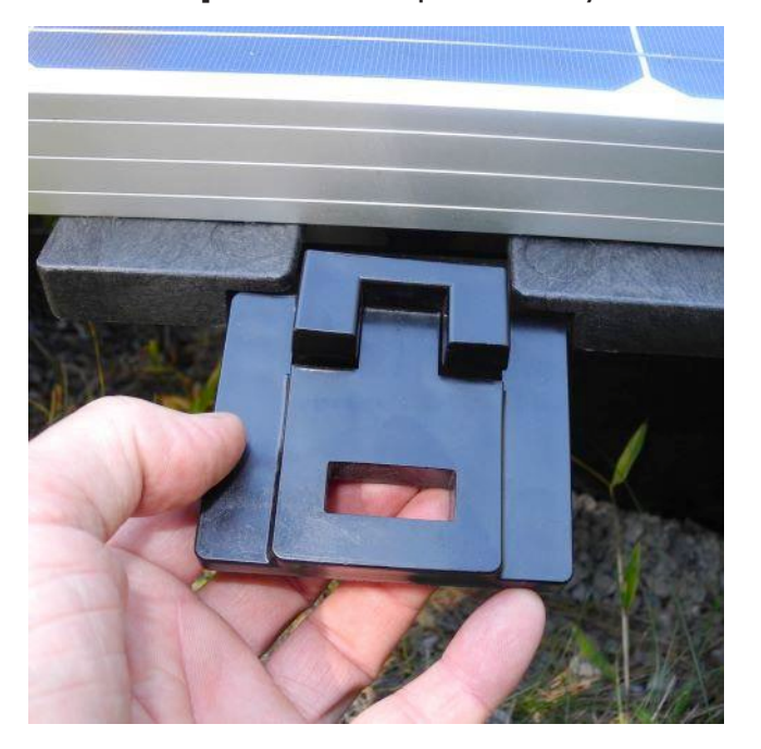
Step 1: Orient clip correctly.

Once the panel is properly in place on the PowerRack and frame flange fully seated in the high side slots, install the sliding retainer clips on the low side using the following steps.