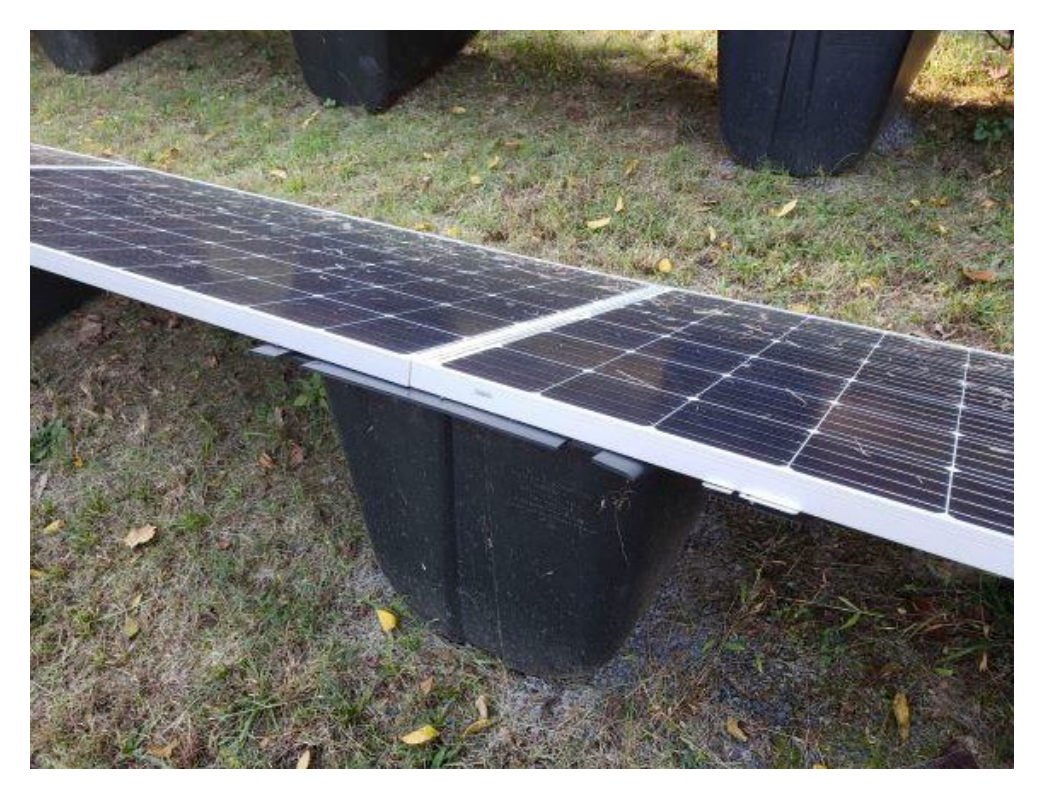
Figure 5. Adjacent panels sharing PowerRacks Ground Leveling Recommend / Required