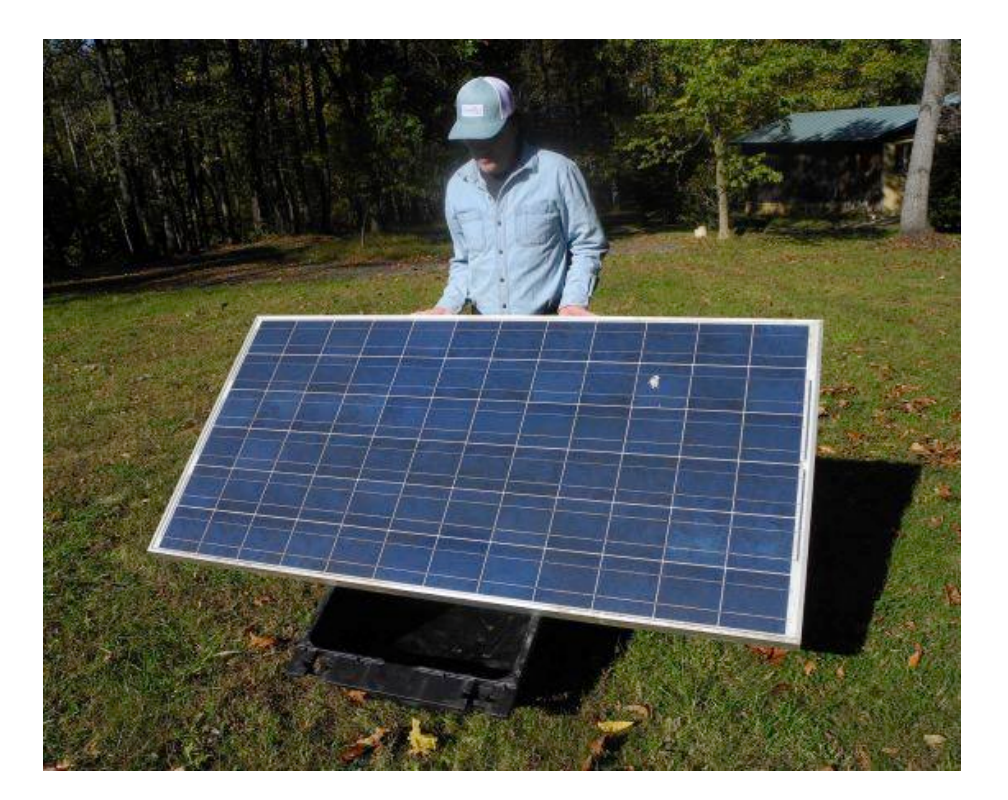
Figure 12. Worker resting panel on the PowerRack side rails ready to slide into place.