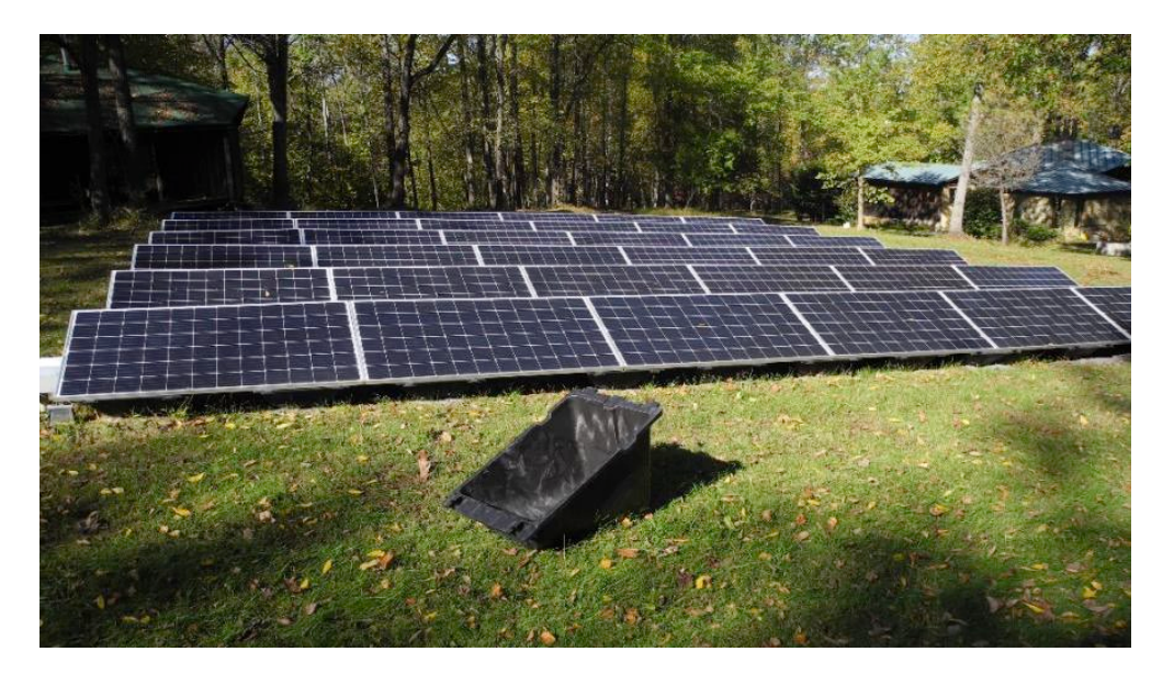
Figure 2. PowerField PV Solar Array