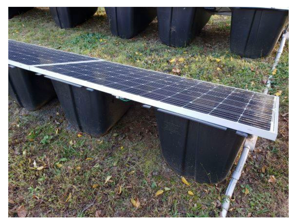
Figure 4. One panel supported by two PowerRacks No Ground Leveling is Required