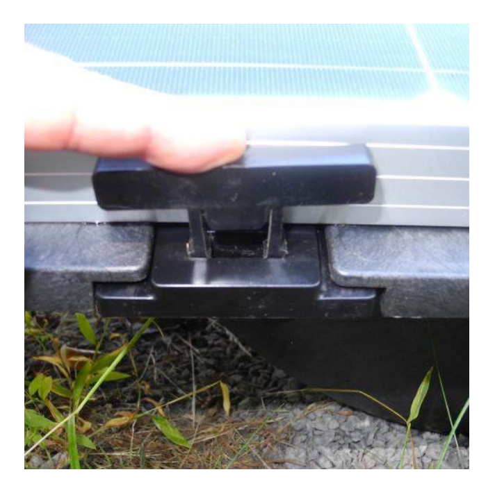
Figure 21. Security key ready to snap into place.

The final step of the mechanical installation is to insert the security as shown in the following photos.