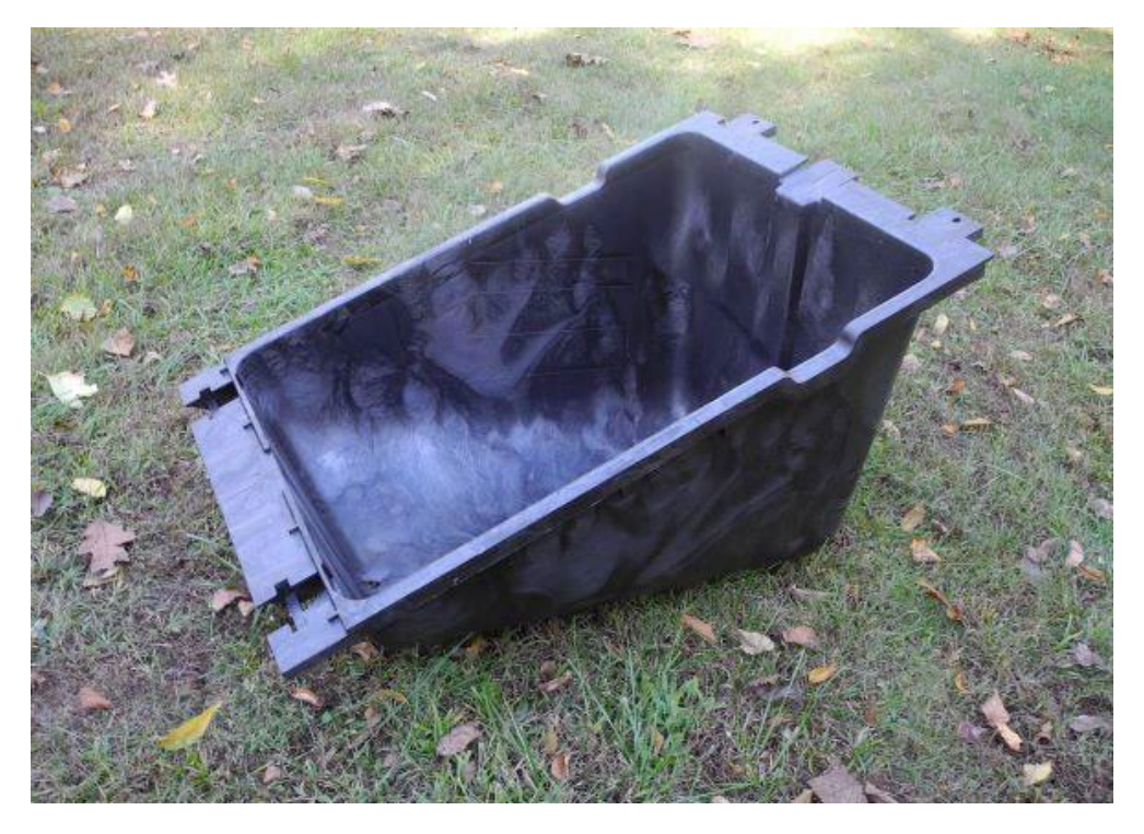
Figure 1. PowerRack

The "PowerRack" is a mounting system suitable for any size of PV ballasted solar arrays.