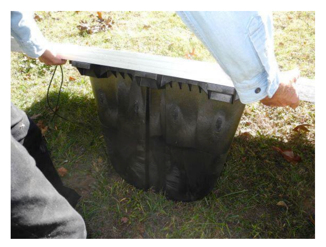
Figure 14. Panel resting on tabs ready to slide down to seat panel frame flanges in slots.