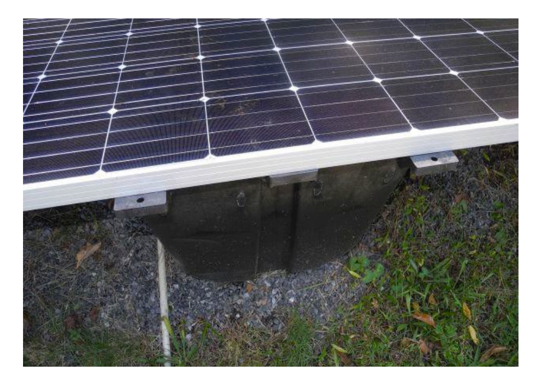
Figure 16. Panel fully seated in the PowerRack high side slots.