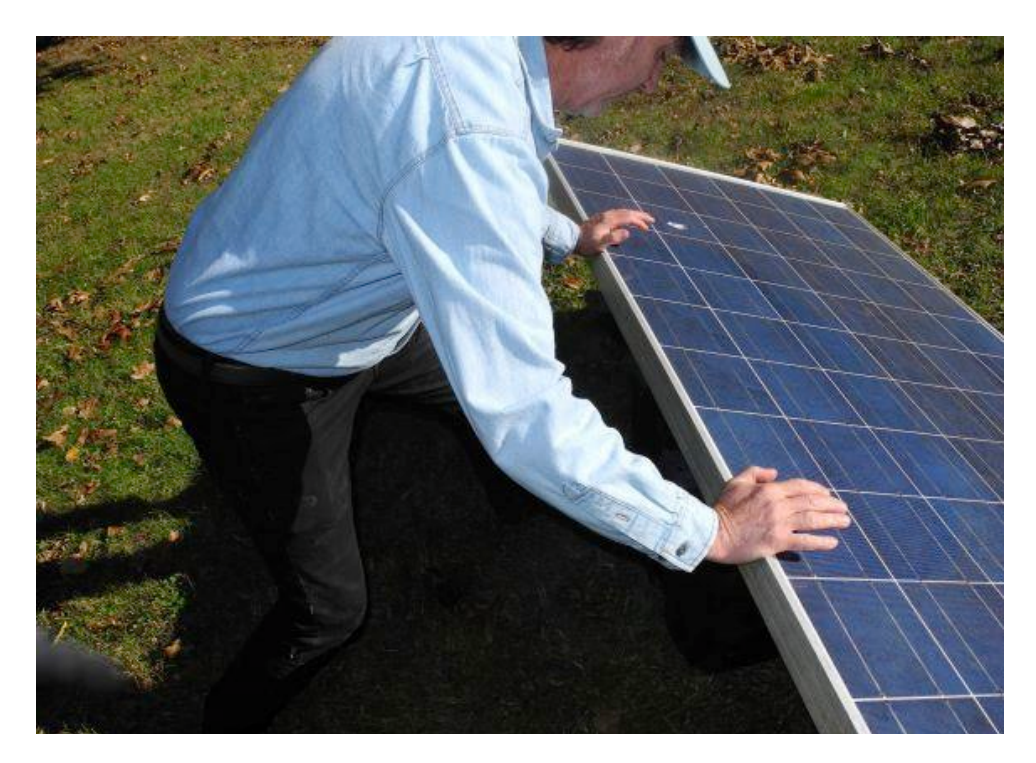
Figure 15. Worker pushing panel down into slots.