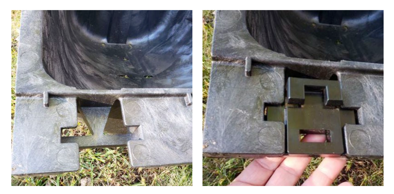
Figures 10. and 11. Close-ups of slot for sliding retainer clip